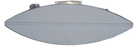
End cap detail