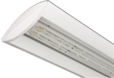
From bottom with lens removed