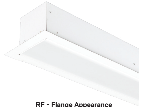
RF - Flange Appearance