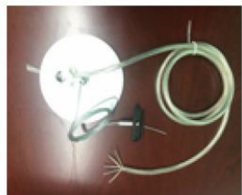
Hanging Kit includes canopy and power feed (A-HCPF606WH5W or A-HCPF612WH5W)