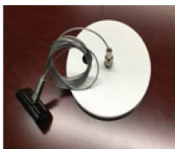
Non power feed side (A-HCNPF606WH or A-HCNPF612WH)