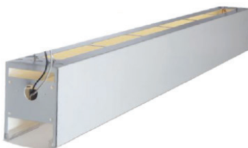
Uplight & Downlight