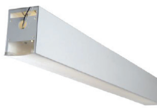
Continuous Run End