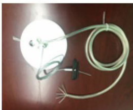
Hanging Kit includes canopy and power feed (A-HCPF606WH5W or A-HCPF612WH5W)