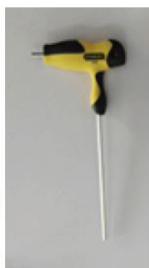
Joiner Tool (AIOCJOINERTOOL)