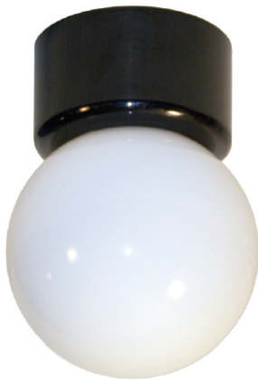
BCC-SCREW NECK GLOBE