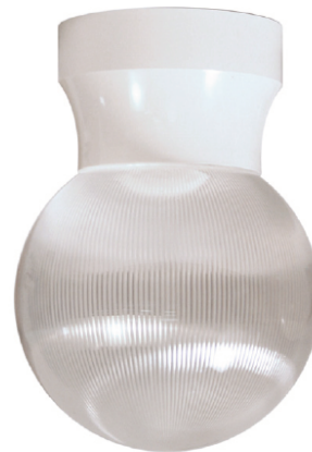
BPC-SCREW NECK GLOBE TAPER