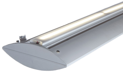
Showing the upright option