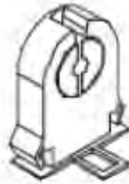
T8 Style lamp holders only available for 8 ft. kit

[1] Shunted lamp holders (L10) are suitable for instant start ballasts, un-shunted (L11) for rapid or pro start ballast